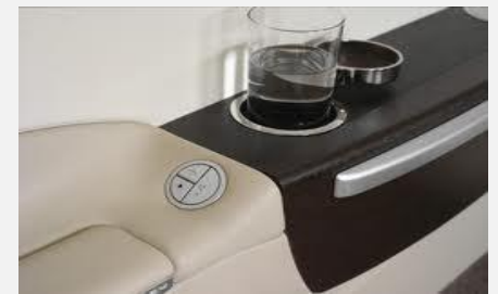
Armrest & Cup Holder

The Phenom 100 light-jet combines next-generation technology, efficiency, style, comfort, performance and reliability. It has the largest cabin, windows and baggage capacity in its class.