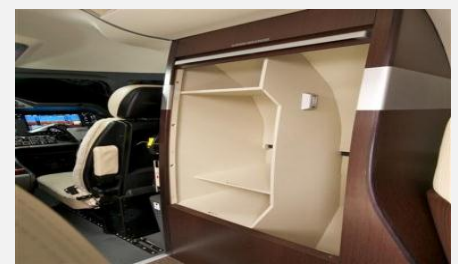
Coat Closet & Storage